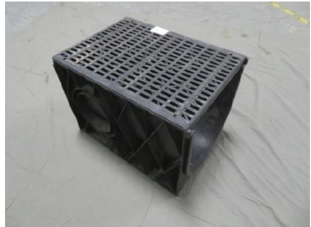
Fig. 4 Pictures of sample after load-bearing test