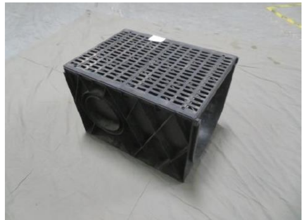
Fig.2 Pictures of sample before load-bearing test