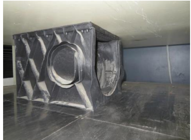
Fig.3 Pictures of sample during load-bearing test